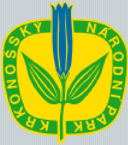
Picture of Willow gentian